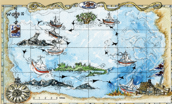
The Map of Tofu Ling Sets Sail's World

The relative location of the San Juan Islands is that they are in the Pacific Northwest region of the United States and in the state of Washington.